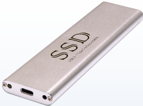
U31MR Dual mSATA SSD to USB 3.1 TYPE C RAID Adapter x1