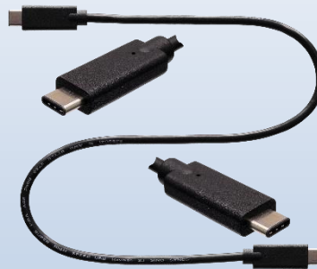
Y24-U02-050 USB 3.1 C-type to USB3.1 C-type Cable 50cm x1