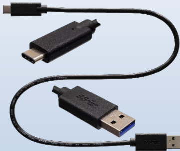
Y24-U01-050 USB 3.1 C-type to USB3.0 A-type Cable 50cm x1