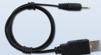
Y05-U17-060 USB A Male to DC Power Cable